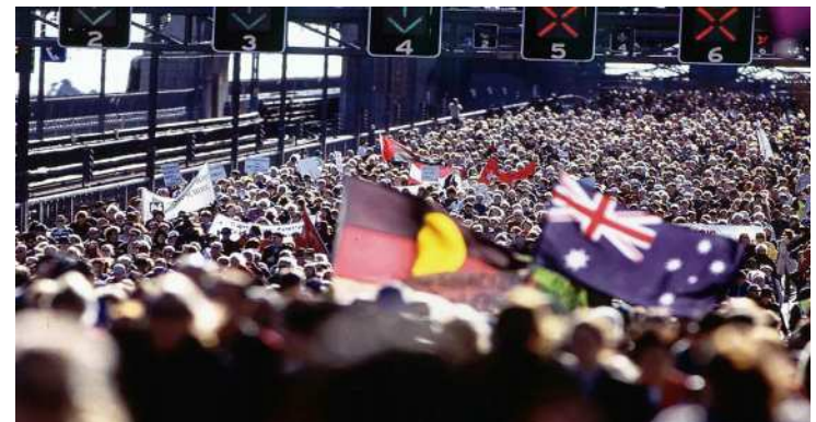
Sydney Harbour Bridge - 250,000