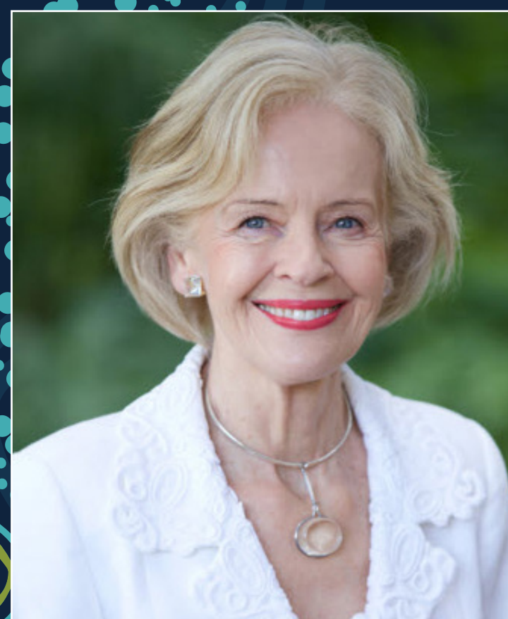
The Honourable Dame Quentin Bryce AD CVO

"Reconciliation Queensland is a voluntary organisation that works hard to achieve equity and respect for all. I am proud to have been associated with RQI as its Co-Patron since its inception. This Strategic Plan will build on the already good work established and promote future activities."